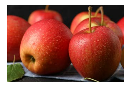
420kj (100cals) 4g fibre

Salmon with \frac{1}{2} a cup of sweet potato mash and 1 cup of steamed Asian greens (bok choy, Chinese broccoli or Pak Choy.)